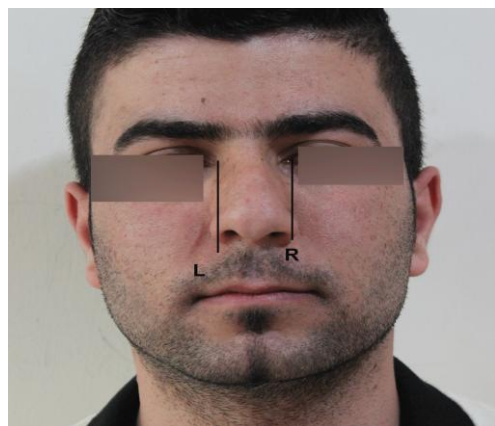
Figure(1) Two vertical lines pass the intercanthal distance

a harmonious face. This is true as long as the intercanthal distance is normal (normally 31–33 mm) ( Figure1 ). If the intercanthal abnormal (broad or narrow) the orbital fissure (the distance from the medial to lateral canthus) can be used as a guide to decide the width of the alar base. For analysis of this zone, a vertical line drawing from the medial canthus in a nose with an optimal alar base should pass 1 mm medial to the outer boundary on each side of the alar base, as long as the intercanthal distance is normal.[12]