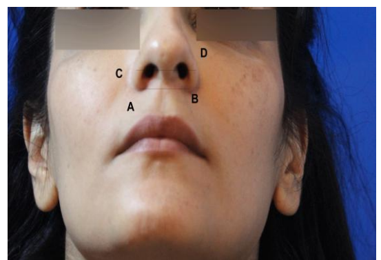
Figure( 4) : Alar base width (A-B); Alar flare (C-D)

Lengths of several distances are calculated in order to individually optimize alar base reduction. The base width refers to the width of the nostril on base view at the alar facial junction. Fig( 4)